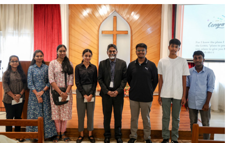
Staff children were honored with Merit Awards