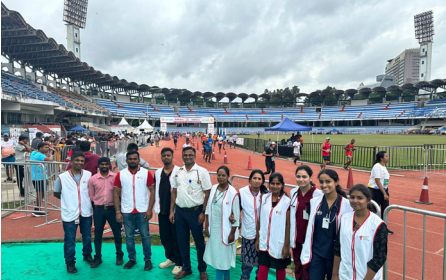
24 Hour Stadium Run, BBH was the official medical partners of NEB sports